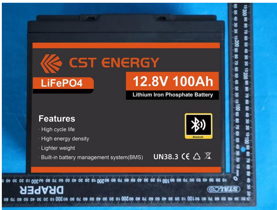
Photo 1 电池组正面 Front view of battery