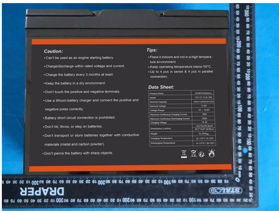
Photo 2 电池组背面 Back view of battery