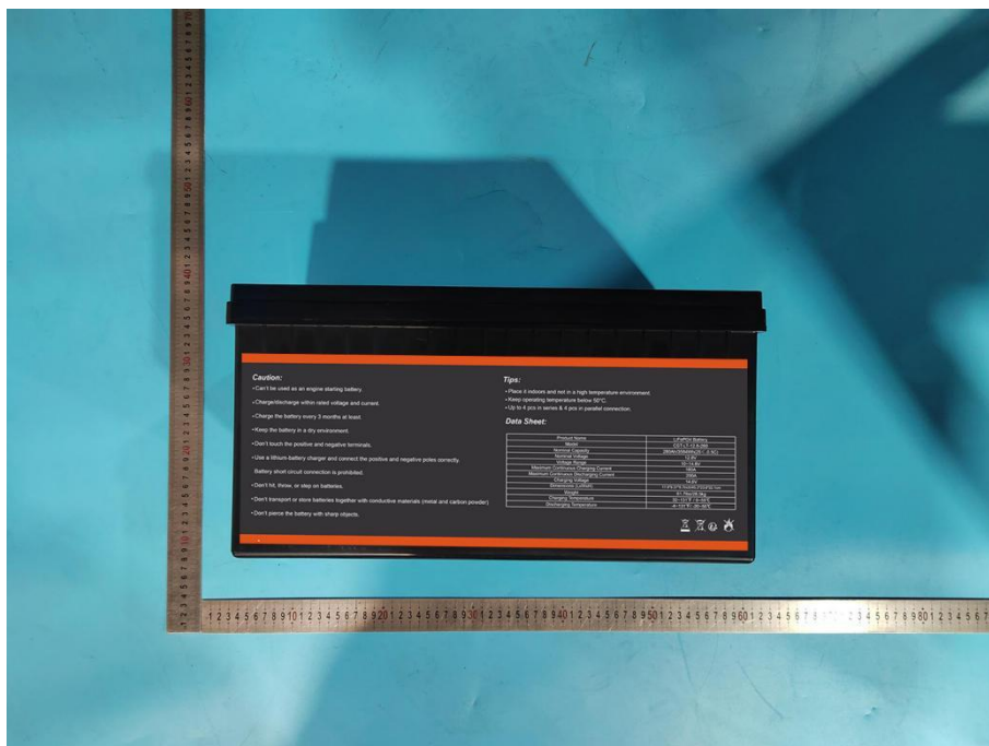
Photo 2 电池组背面 Back view of battery