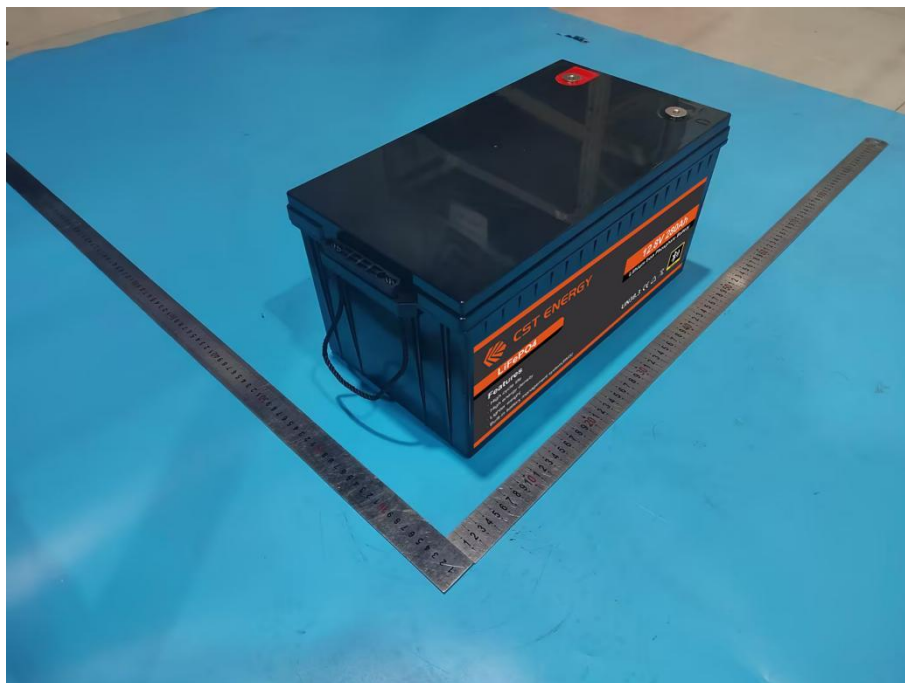
Photo 1 电池组正面 Front view of battery